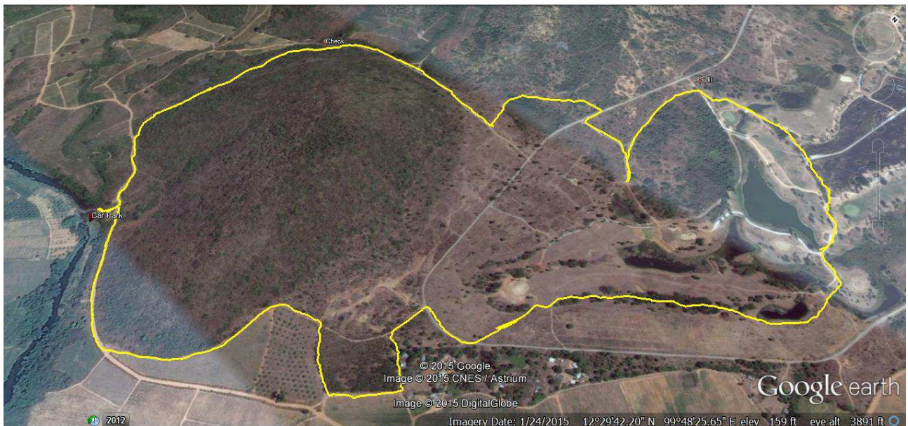
The Walkers Trail as recorded by Hugmanannygoat