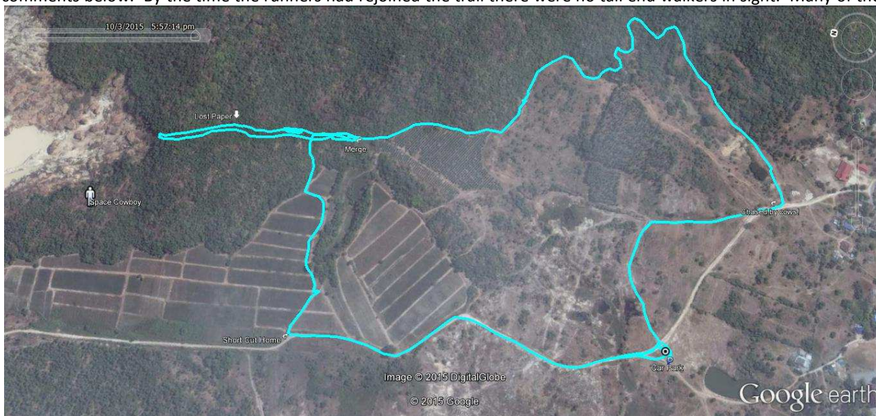
Trail as completed by Hugmanannygoat – showing missed left turn and short cut home.

the on in. So through the wet grass and muddy puddles to the first check were the Butt Out was making headway in the direction of the wet paper trail. From here it was on a familiar path from previous trails in the area to the run/walk split some 1.9 km from the start and a couple of checks. At the split the runners left the main trail, see comments below. By the time the runners had rejoined the trail there were no tail end walkers in sight. Many of the