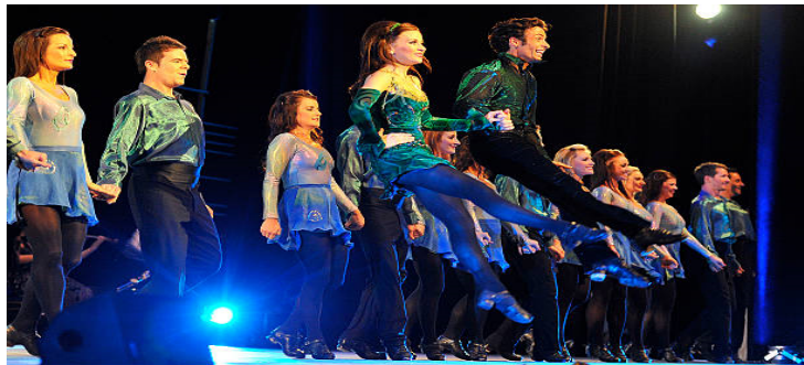
Some Tea-Potting hashers at the reservoir

It really was a very pleasant trail, winding in and out of sparse woodland, past farm houses (a herd of inquisitive cows followed us for a short distance, I'm sure it was the smell). Next came a reservoir where the runners had looped earlier.